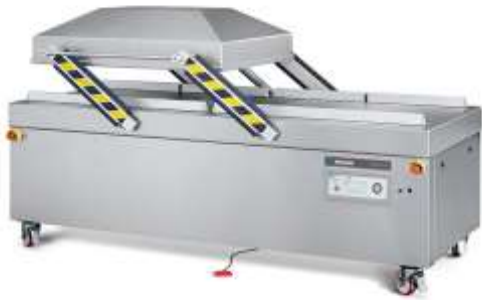
*with option automatic lid