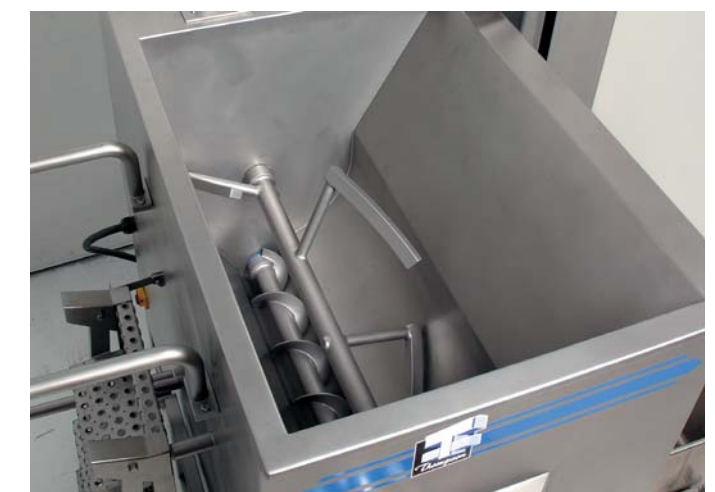
Model 6400 with programmed reciprocating paddle.