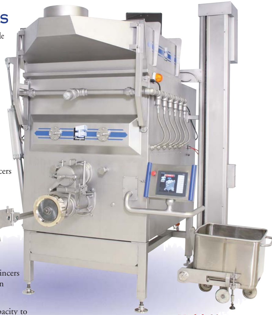
Model 6600 - 66 shown with 37 kW Variable Speed Control

The combination of an exceptional paddle design, multi-directional bowl transfer screw and separate mincing feedscrew delivers tremendous versatility of mixing and mincing capabilities to suit many applications.