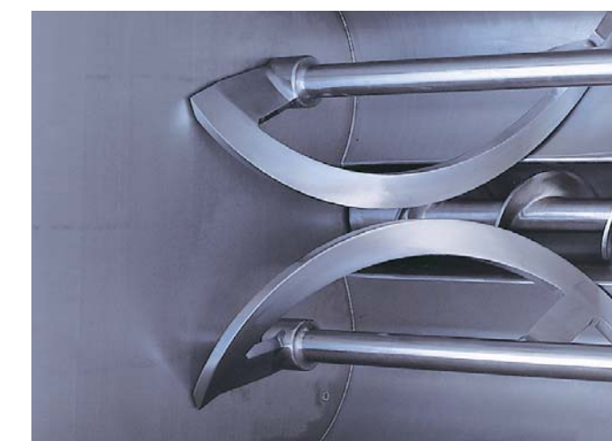
Mixing ribbon option