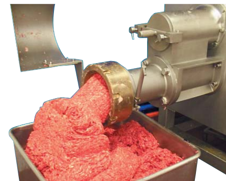
Beef Trim. 2nd Mince - 3600 kg / hr (60kg/min). Processed with 6400 66 Mixer Mincer through a 3 mm Hole Plate.