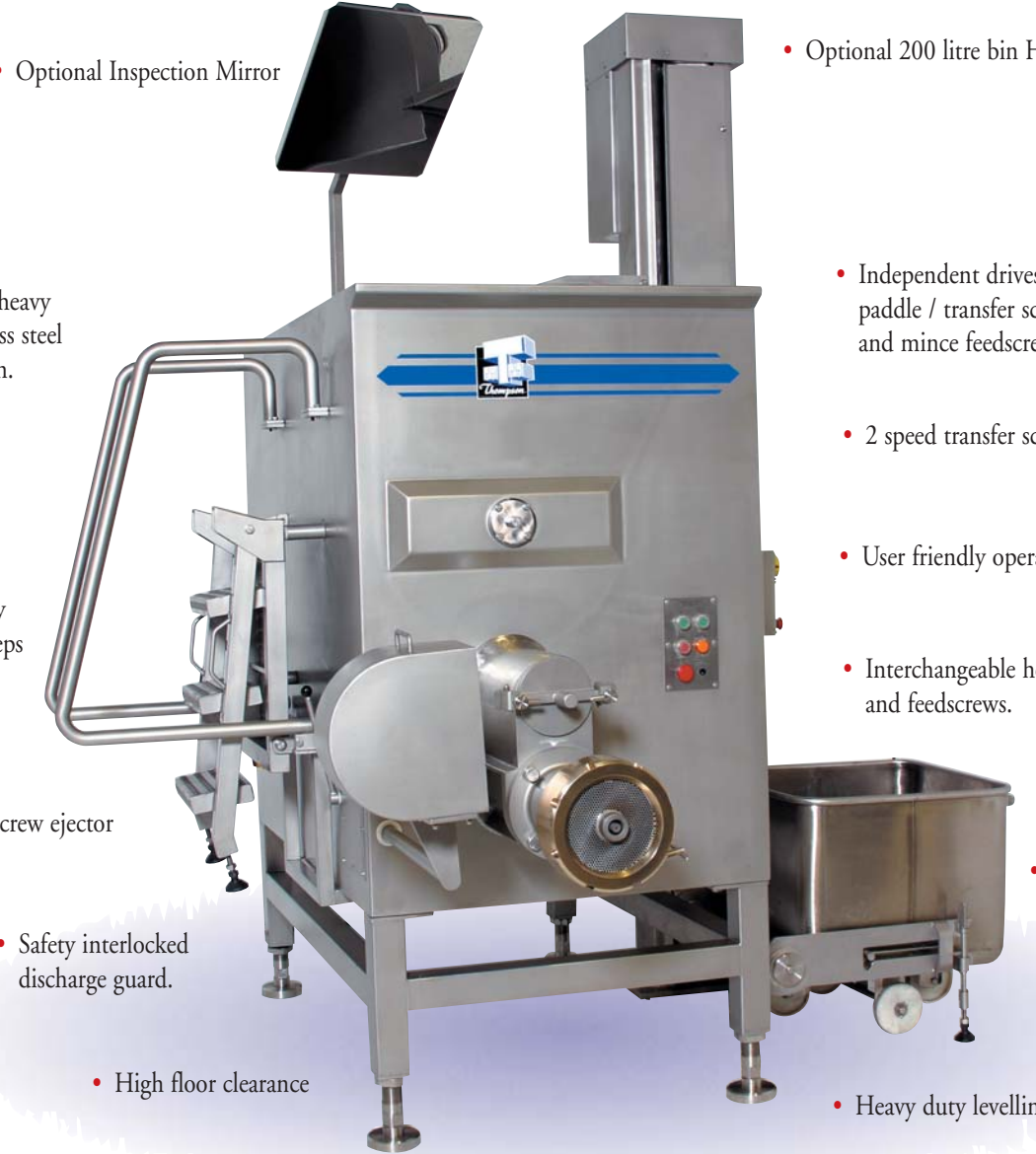
Model 6400 - 66 shown with optional inspection steps and handrail combined with Thompson 200 litre bin hoist